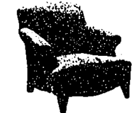
Colette Chair, SALE $599