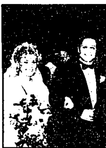
West Bloomfield before leaving on a cruise in the Eastern Caribbean. They are making their home in Beverly Hills.

The couple received guests at Shenandoah Country Club in