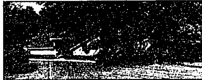
UNIQUE CALIFORNIA CONTEMPORARY

Bloomfield Hills. An incredible property built in 1984. ELEGANT and IMPECCABLE maintained walkout ranch of APPROX. 4500 SQ. FT. Luxurious first floor master suite w/ Jacuzzi. Gourmet kitchen, formal dining room, library, cedar shake roof, 3 car garage. $599,000 442793QUA 645-2500