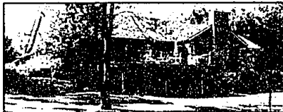
PARADISE RIVER FRONT SETTING.

Paradise setting with 135 ft. waterfront and access to all-sports lake. Contemporary gem with luxury first floor master. Marvelous custom appointments and built-ins. Gourmet island kitchen. Fabulous views. $675,000 439440LLS 645-2500