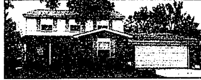
BETTER THAN NEW COLONIAL

New everything!! Great open floor plan takes advantage of beautiful and private back yard. Doorways from living room open to deck with pool off to one side of acre plus lot. Great master suite with dressing room and bath. This home is stylish and sophisticated. $219,000 425084MAP 647-0100