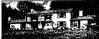
DON'T SETTLE FOR LESS!

Harold Turner designed home in Bloomfield's lake area. Very private with views from every room. Home has been maintained with a keen eye to detail and quality. Call for your preview today. $1,450,000 445209 647-0100