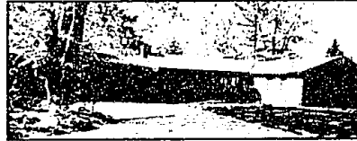
TOTAL RENOVATION IN 1988

Quick possession. Superb custom built original owner, quality throughout. The foyer with circular staircase, dramatic cathedral ceiling in living room. Handsome family room w/ fireplace. Great floor plan. Beautiful lot immediately adjacent to Wakelee. $309,000 445675FIE 645-2500