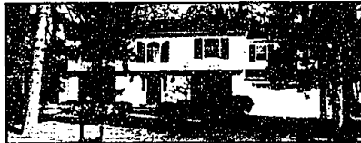
BIRMINGHAM PRIME AREA

In the heart of Bloomfield Hills. Vaulted ceilings in great room and dining room. First floor master suite with whirlpool tub. Two additional bedroom suites with full baths, open, airy, skylighted kitchen. Amenities galore in an outstanding location. $485,000 425355BOU 647-0100