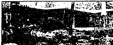
LOWER LONG LAKE!

Authentically appointed English Manor home with estate setting, including gatehouse. Two story beamed great room with stone fireplace, formal dining room and library. Leaded windows. Pewabic tile, 3 baths, updated kitchen, security system. $1,750,000 438180LGL 647-0100