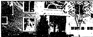
SOPHISTICATED, ELEGANT AND CONTEMPORARY

Custom oak gourmet kitchen, great room, deluxe master suite plus 3 additional bedrooms, 3 baths, 1 lavatory, family room, his and hers libraries, sky floor, central air, deck, patio. Professionally landscaped. Near Kirk-in-the-Hills. $499,000 44082APL 645-2500