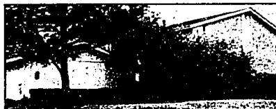
WONDERFUL END TOWNHOUSE CONDO UNIT

In choice Troy Subdivision. Many new improvements, hardwood floors, newly decorated inside and out, new drapes, windows, carpeting, roof and sharp landscaping. Everything one would like in a home. $219,900 447972ROX 645-2500