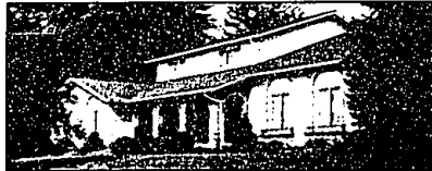
BLOOMFIELD HILLS SCHOOLS

Large 3300 sq. ft. home. New kitchen and new carpet on first floor. Features include a library, first floor laundry, large family room with fireplace and access to decks. Walkout lower level, 3 car garage, 3 full baths, much more. $469,900 433941 647-0100