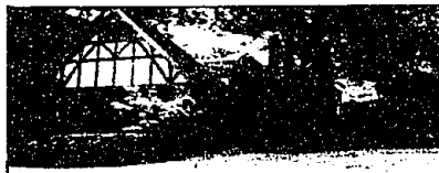
151 FEET ON LOWER LONG LAKE!

FRANKLIN 32440 Franklin Rd 626-8700 WEST BLOOMFIELD 5839 W. Maple 855-2200