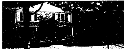
A LOVELY UNIT IN THE WOODS

In Pebble Creek! Bright open floor plan. Finished basement with dramatic inground whirlpool and sauna w/shower. Large sitting room off master bedroom overlooks living room. Unit is well located in complex with view of beautiful ground courtyard entrance. $191,000 431091BRI 647-0100