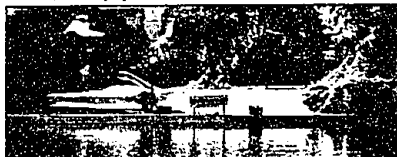
UPPER LONG LAKE-BLOOMFIELD HILLS SCHOOLS

Prime city of Bloomfield Hills location on secluded cul de sac. Elegant home. Many recent updates including "Gourmet" kitchen, fine details: crown moldings, Verde marble foyer and powder room. Three fireplaces, great room 30 x 26. $675,000 432345LOW 645-2500