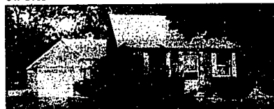
COZY BRICK HOME

In desirable area of Birmingham. Beautiful hardwood floors, table space in large kitchen. All new in the last 6 years. Comfort maker furnace, hot water heater, copper plumbing, windows throughout, roof shingles, cement driveway, and Florida Room. $140,900 440000SHI 645-2500