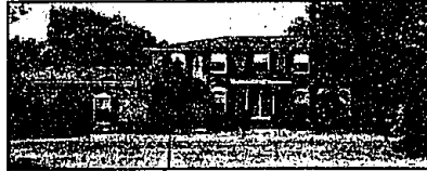
POPULAR VERNOR ESTATES

5 bedrooms, 3.5 baths, family room, library and recreation room. Circular drive, hardwood floors, neutral tones, well maintained. $469,000 424348SHI 645-2500