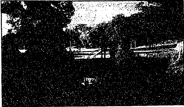
Picnic fun: Boy Scout Troop 110 served up dinner to celebrate the fellowship of scouting.

were served. Anyone interested in joining the troop should call Joe Briscat at 478-0806.