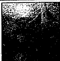
© 2 - Autumn at Ashley's Cottage

This and other Thomas Kinkadee Limited Edition Canvas Lithographs, hand retouched with oil are available at: