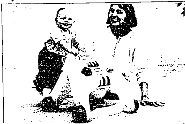
Emphasis on ability: Many of today's toys like this Play About Walker and the Wheelchair, Ramp and Friend by Little Tikes offer children with disabilities fun and learning at the same time.

The fish and pole can be stored in the see-through tackle box ($15-$20).