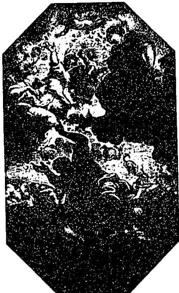
The Dreams of Men , c. 1546-47. (City of Detroit purchase.)

The Detroit Institute of Arts commemorates the 400th anniversary of Tintoretto's death with the re-introduction of The Dreams of Men , after nearly four years of comprehensive conservation treatment. See this major work, along with two other companion paintings by the Renaissance master, on view in the DIA's Special Exhibition Galleries. FREE WITH MUSEUM ADMISSION