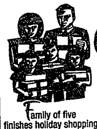
Family of five finishes holiday shopping