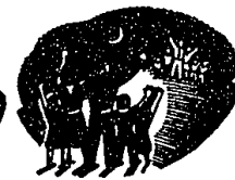
At home by 9, already feeling closer to distant relatives.

Extended Holiday hours at these locations.