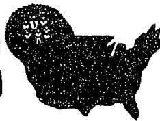
for 6 distant relatives