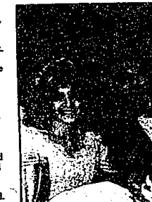
St. Mary's Cultural Center before leaving on a trip to Hawaii. They are making their home in Farmington Hills.