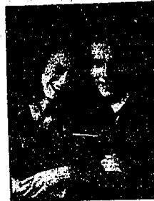
A July wedding is planned at St. Fabian Catholic Church.

Her fiancé is a graduate of Birmingham Seaholm High School and Ohio State University. He is employed with Klenzade, a division of Ecotek.