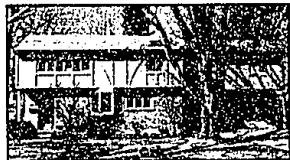
OPEN SUNDAY 2-4 1632 Latham, Birmingham. Warm, inviting Tudor style Colonial. Dynamic master bedroom with walk-in closet and master bath. Updated kitchen with eating area and bay window. Fireplace overlooks lovely yard. Skylights, fireplace, deck. $254,900 647-1900