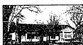
OPEN SUNDAY 2-5 16118 Locherbie, Beverly Hills. NEW ON THE MARKET! This is the one you've been waiting for! Charming ranch with countless updates. Hardwood floors, bay windows, crown ceilings, moldings. Over-sized private lot, attached garage. $168,725 647-1900