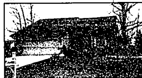
OPEN SUNDAY 1-4 2202 Hickory Leaf, Farmington Hills. This custom built home features cathedral ceilings, skylights and a large loft overlooking the great room. Gorgeous white curvilinear kitchen and a first floor master bedroom. $209,500 (810) 878-3400