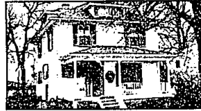
FAIRMINGTON 1910 "Sears" home is perfectly decorated and offers formal living and dining rooms, family room, 3 bedrooms, natural woodwork, hardwood floors, sauna, tiled deck and beautiful gardens. $174,750 (DE720MAP) 399-1400