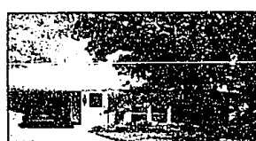
OPEN SUNDAY 1-4 2705 Lakeshore, Bloomfield Township. Room for expansion. Invest in your future with this charming 3 bedroom, 1 1/2 bath ranch home on beautiful grounds. Bloomfield Hills schools. Carpet, quick possession. $154,900 648-1800