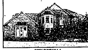
OPEN SUNDAY 1-4 6185 Country Ridge, Troy. Fantastic former model is professionally decorated and landscaped. 2 1/2 baths, library, central air, natural fireplace, security system, sprinklers, 3+ car garage and much more. Pack your bags and move in. $315,900 (810) 878-3400