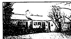
OPEN SUNDAY 1-4 18589 Kirkshire, Beverly Hills. Exposed hardwood floors, freshly painted, 3 bedroom ranch with Florida room. Beautifully landscaped, absolute move-in condition. $119,900 647-1900