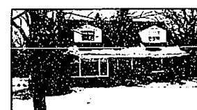
OPEN SUNDAY 1:30-4:30 18859 San Quentin, Lathrop Village. Neutral decor and many recent updates. Furnace, air conditioning, roof, hardwood floors, paint and basement waterproofing. There are 3 bedrooms, 1 1/2 baths, 2 fireplaces. $144,900 642-2400