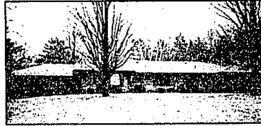
OPEN SUNDAY 2-4 1941 Millford, Millford, 3 + Green Acres. Two homes offered. Both homes renovated throughout. Main home has 3 bedrooms, 2 baths, family room and hot tub. 2nd home good for rental income. Most appliances. $350,000 648-1800