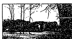
OPEN SUNDAY 1-4 188 Lakewood, Troy. This home sits on a country lot with mature trees and features a maintenance free exterior, master bedroom with bath and walk-in closet, formal dining room oak cabinets and much more. $159,900 (810) 878-3400