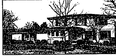
OPEN SUNDAY 1-4 3753 Lane Lake, Bloomfield. Well maintained 4 bedroom colonial with hardwood floors, central air large fenced yard with pool. Florida room, circular drive $319,000 648-1800