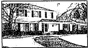
OPEN SUNDAY 1-4 965 Adams Castle, Bloomfield. Spectacular, well maintained, 4 bedroom Colonial on a private cul-de-sac close to Birmingham schools. Many updates. Hardwood floors under carpet. Perfect transfer home $279,900 642-2400