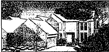
OPEN SUNDAY 1-4 3338 E. Weebek Lake Dr., Bloomfield Twp. Gorgeous lakefront condo with 10' ceilings, hardwood floors, skylights, kitchen and library with built-ins. Three bedrooms, walk-out lower, strum, first floor laundry. $548,900 648-1800