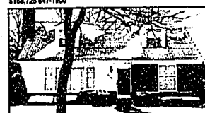
LEASE, LEASE, LEASE Royal Oak 2 year lease, 90 day breakouts, 3 bedroom, 2 bath. Charming home fireplace in living room, with wood floor. $1,200 (DEWB300J) 737-4000