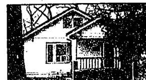
PERFECT This home is loaded with charm and character! It features exposed hardwood floors (oak) throughout, updated kitchen and bath, extensive landscaping and so much more. $114,850 (DEWBAJ) (810) 878-3400