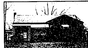
SPARKLING GEM Wonderful location for this Farmington ranch. Large fenced yard, freshly painted inside and out. 3 bedroom, 1 bath. $114,700 (DEWB228EA) 737-4000