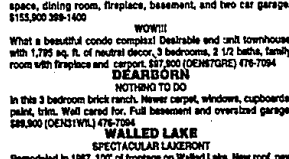
WALLED LAKE Spectacular LUXURY! Remodeled in 1987, 100' of frontage on Walled Lake. New roof, new siding, new kitchen and furnace. $174,900 (DEW7CQA) 478-7054