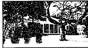
OPEN SUNDAY 1-4 2961 Orchard Trail, Troy. Large lovely ranch with plaster walls, hardwood floors, 2 fireplaces, full finished basement. Each bedroom with own bath. 1/2 acre plus 2 1/2 car garage with driveway. $187,900 647-1900