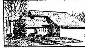
OPEN SUNDAY 1-4 5700 Pointe Of The Woods, West Bloomfield. Dramatic contemporary features a huge great room, skylights, alarm, finished basement, 1st floor laundry, custom deck, interior with marble, grounds maintenance $150 monthly. A steal of a deal!! $209,900 (810) 878-3400