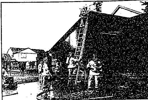
A ladder up: Farmington Hills firefighters wrap up their efforts at saving the Jerry Hatfield house on River Bend Drive.