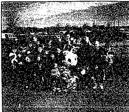
Total Fitness program: Youngsters crowd around the Easter Bunny April 16 following an Easter egg hunt sponsored by Total Fitness on Orchard Lake Road in Farmington. About 60 took part, said Mary Ubats, Total Fitness director.