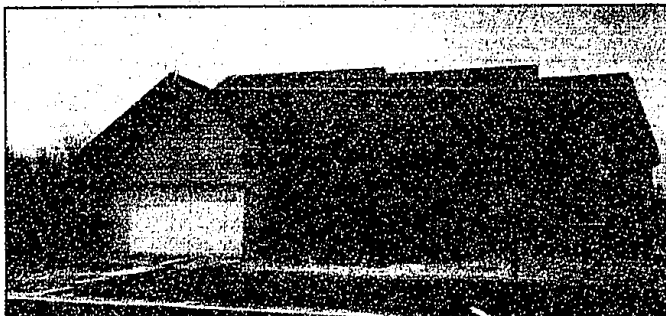
Blarcrest: The master suite in this model is on the main floor, additional bedrooms upstairs.

Divine Homes and Chateau Homes have 26 and nine lots, respectively, on the wooded site developed by Billmore of Troy. Divine also is building the same