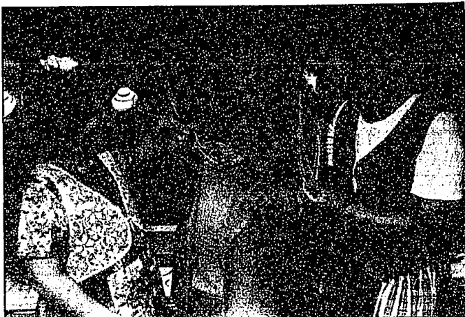
Pearls are perfect: Genevieve Fitzsimmons of Livonia (center) shows granddaughter Kaitlyn Puninske, 9, and daughter Kimberly, some gift ideas from the fine jewelry department.

The family agreed that shopping together that day was even more special than their purchases.