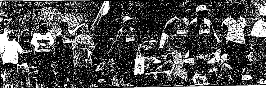
Marching along: Excellent spring weather Sunday afternoon no doubt helped swell the Farmington CROP Walk crowd to 439.