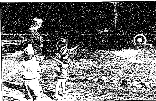
Bull's eye! Day camping in Farmington Hills hits the mark for about 1,000 kids during the summer months.

A lot of people like the idea of the day camp, because it serves as a training experience for campers who will later try more primitive