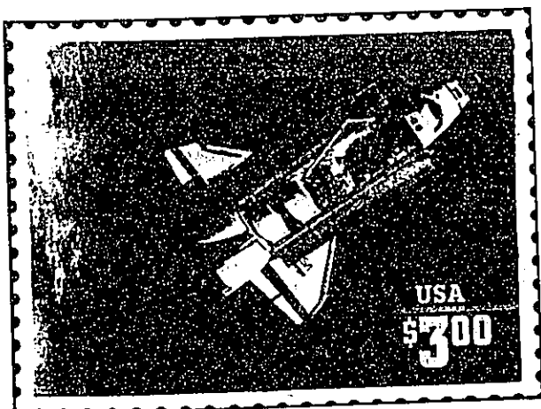
Challenger: A new stamp shows the space shuttle in flight on a 1983 mission that carried the first U.S. woman into space.