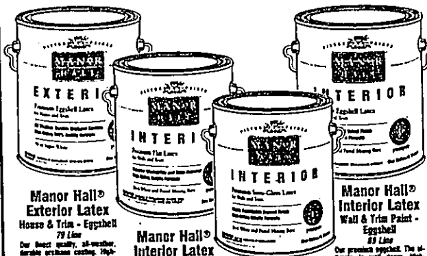
Manor Hall® Exterior Latex House & Trim - Eggshell 79 Lbs

How do you improve on an interior and exterior paint made to the highest possible standards? You add two premium interior finishes like our new flat and semi-gloss paints. Both have durable acrylic formulas that cover easily and dry to a smooth, enamel finish. What's more, they resist the kind of household stains that leave other paints marked for life. In a palette of colors to complement your style, these paints also complement the already-famous Manor Hall® interior and exterior eggshell products. With these two new paints, your entire home can benefit from one of the best line of finishes on the market. Manor Hall from Pittsburgh® Paints. Next to this, ordinary paints just fade into the woodwork.