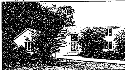
WATCH THE SAILBOATS

Soft contemporary with deeded access to Pine Lake. Great room with soaring ceilings, fireplace and wet bar. First floor master and laundry. Basement and three car attached garage. Bloomfield Schools. $489,000