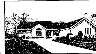
FISHING & SWIMMING

Walk out the exposed lower level and down to the beach to go swimming or fishing. Views of the lake from every room in this open and bright home. Kitchen with eating space. Three car garage and more. $695,000