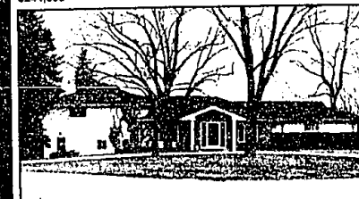
NEAR FRANKLIN VILLAGE

Near the Village of Franklin with an in-ground pool and stable with corral at the back of the professionally landscaped lot. Large kitchen with eating space, living room and family room, each with their own fireplace and much more. $439,000