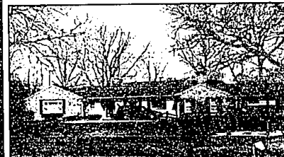
QUIET & PRIVATE

Set back at the end of a dead-end street. Large living room with fireplace and picture window that views a large natural area to the rear. Three bedrooms, two full and one half baths. Kitchen with eating space and much more. $249,900