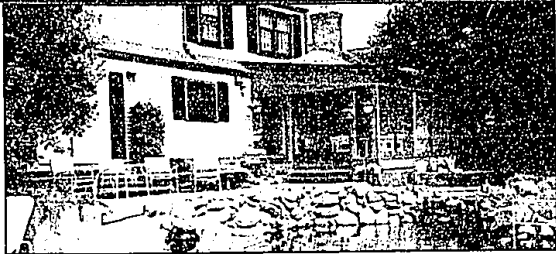
OPEN SUNDAY 1-4

800 W. Long Lake Rd. Bloomfield Hills 647-8100