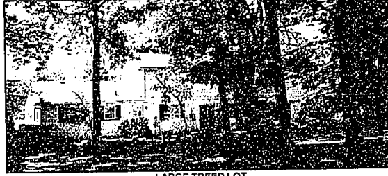
LARGE TREED LOT

Stay cool this summer in the lovely treed rear yard. Formal living room with fireplace. Formal dining room. Four extra large bedrooms on the second floor and a bedroom or den on the first floor. Family room and finished rec room. $481,900