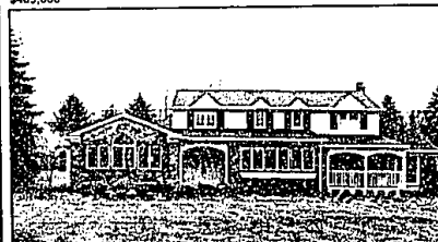
OVER ONE ACRE

Set on over one acre of magnificent grounds. First floor master suite with private dock. Three additional bedrooms on the second floor. Generous sized kitchen with eating space. Central air and more. $378,900