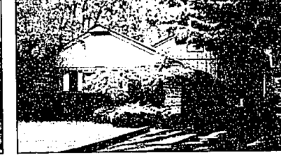
WING LAKE A FEW STEPS AWAY

Four quality finished levels of living all within a short distance of Wing Lake. Crown moldings and other fine detailing throughout. Large kitchen with eating space and doorway to quiet deck to the rear. Bloomfield Hills Schools. $257,000