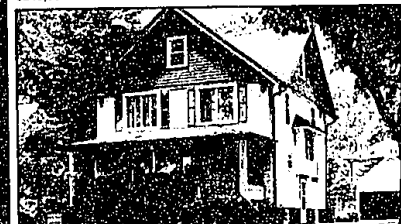
POPPELTON PARK AREA

Covered front porch for quiet relaxing summer evenings. Three bedrooms with a possible fourth bedroom in the walk-up third level. Newer kitchen. Formal living room with fireplace and formal dining room. Two car garage. $244,000