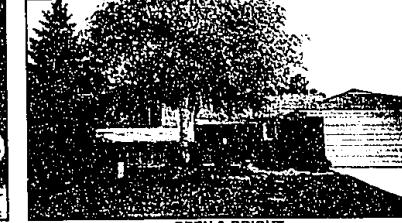
OPEN & BRIGHT

A light open floor plan. Kitchen with cathedral ceiling and eating space. Formal living room, dining room and generous sized family room with full wall brick fireplace. Large deck off the kitchen for summer enjoyment. $169,900