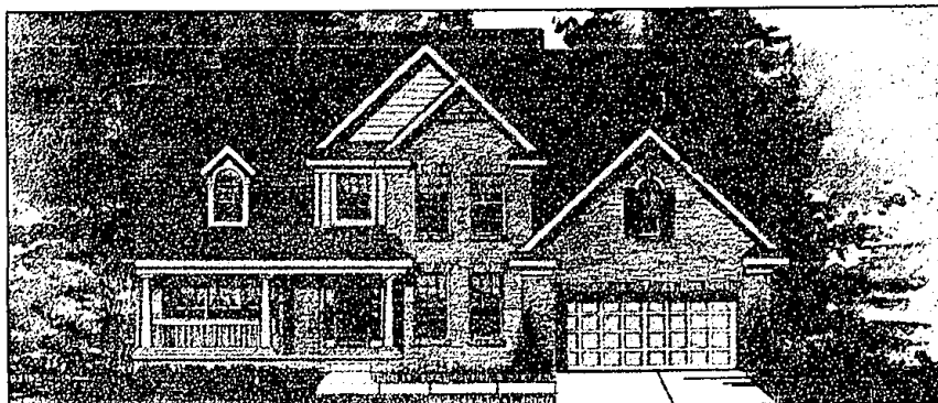
Chelsea: This model, which comes with three or four bedrooms, features a combination living room/dining room with dramatic sloped ceiling off the foyer.

The sales office at Chelsea Crossing, (810) 488-0560, is open noon to 6 p.m. daily.