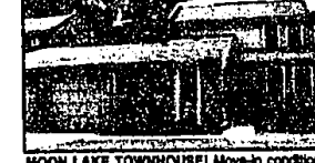
MOON LAKE TOWNHOUSE! Move-in condition. 2 bedrooms, 1st floor den or 3rd bedroom with stall shower bath. Great location overlooks commons, trees. Walk to pool, clubhouse. $137,000 (ED-W-07MOO) 531858 Call 626-4000.