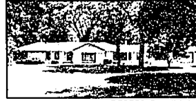
FANTASTIC LOT - MATURE TREES. Beautiful view of woods. 2 fireplaces, 3 bedrooms, one with sitting room. Tub and shower in central bath. Updated kitchen. 2 car garage. $219,500 (ED-W-70SPR) $26033 Call 626-4000.