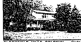
BLOOMFIELD HILLS COLONIAL. Rodney Lockwood built home in Great Oaks. 3-4 bedrooms, 2 full and 2 half baths, private yard, wonderful screened porch. Well cared for home. $399,000 (ED-H-40WOO) 531187 Call 646-1400.