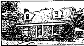
IN-TOWN BIRMINGHAM CHARMER. Walk to downtown Birmingham from this picture-perfect cape cod home with 2 bedrooms, 1 1/2 baths, Florida room, 2 car garage, central air and many hardwood floors. $199,000 (ED-B-37HEN) 532509 Call 644-6700.