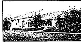
CLASSIC COUNTRY FRENCH. City of Bloomfield Hills gem. Custom built in 1988 by Dave Kellert. First floor master suite, 2 bedrooms up. Gorgeous white marble Carrara kitchen. Slate roof. Private wooded lot. $549,900 (ED-B-75KEN) 531716 Call 644-6700.