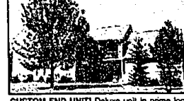
CUSTOM END UNIT! Deluxe unit in prime location. Custom decor throughout this 2 bedroom, 2 bath unit. Euro cabinets in kitchen. Marble fireplace. Turn the key and enjoy! $116,900 (ED-B-19LAU) 525274 Call 644-6700.