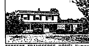
PERFECT TRANSFEREE HOME! Numerous updates! Neutral decor, exposed hardwood floors, large professionally finished recreation room. Bloomfield Hills Schools. $244,900 (ED-W-56BLA) 524335 Call 626-4000.