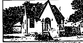
SUMMERTIME FUN ON CRESCENT LAKE! Own this charming 3 bedroom tudor. Hardwood floors, formal dining room, full basement. Clean and ready to move into. $89,500 (ED-W-05ELI) Call 626-4000.