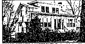
UPPER STRAITS LAKEFRONT! Orchard Lake, West Bloomfield Schools. Magnificent lakefront view and sandy beach. 3 bedroom cottage or spectacular building site. 92 feet of lake frontage. Fantastic investment. $360,000 (ED-W-33SHO) 455270 Call 626-4000.