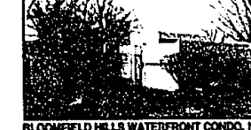
BLOOMFIELD HILLS WATERFRONT CONDO. North Wakeek soft contemporary with dramatic waterfront views. First floor master suite, with walkout lower level, plus 2 bedrooms on upper level. Decorator perfect. $405,000 (ED-B-55ALE) 432771 Call 644-6700.