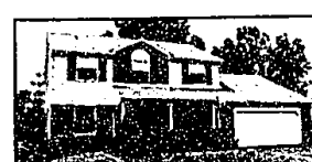
FANTASTIC FAMILY HOME in Wixom's most popular sub with park and lake. 3 bedrooms, 2 1/2 baths, study, family room, full basement. 8 person Jacuzzi in sunroom. Walled Lake schools. $178,900 (ED-W-19CHA) Call 626-4000.