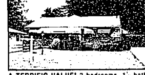
A TERRIFIC VALUE! 3 bedrooms, 1 1/2 baths, hardwood floors under carpet. Wonderful enclosed summer porch. Private fenced back yard. Near shopping. Birmingham schools. $110,500 (ED-W-40THI) 531874 Call 626-4000.