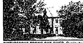
PICTURESQUE TROY'S OAK RIVER. Quality built center entrance colonial. 2-story family room with stacked bay window. Private master suite with sitting area. Library. Full basement. Swim Club Association Membership. $349,800 (ED-B-97RIV) 529780 Call 644-6700.