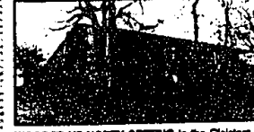
WOODED UP-NORTH SETTING in the Cloisters on the Lakes. Courtyard entry with patio. Library with fireplace. Lower walk-out, double decks. Close to pool, clubhouse, tennis and lake privileges. $189,000 (ED-H-789OR) 503085 Call 648-1400.