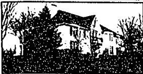
STUNNING FRENCH CHATEAU. Custom built, gracious grounds and fenced patio with lap pool in rear. Elegant foyer with circular staircase. 4 bedrooms, 3 full and 2 half baths. Lavish master suite. $850,000 (ED-H-355YC) Call 648-1400.