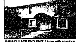
IMMACULATE END UNIT. Upper with spacious rooms, extra windows and top-of-the-line appliances in updated kitchen. Neutral carpet throughout. Immaculate. Large basement with tons of storage, 2 carpets. $87,000 (ED-H-63MUL) 532530 Call 648-1400.