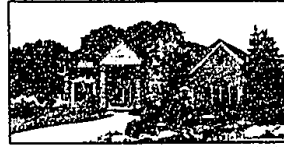
CITY-COUNTRY SETTING. Exceptional combination of location, schools and architectural layout. Top-of-the-line amenities: dual stairs, large master suite, guest suite, 4 bedrooms, 2 full and 2 half baths. $589,000 (ED-R-60MUR) 533370 Call 650-4500.