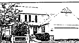
FABULOUSLY CHARMING HIGHLAND. Hardwoods in foyer kitchen, powder room. Berber carpet throughout, designer treatments. Luxurious master bedroom with cathedral ceiling. Finished lower level. Heaters club association membership transferable. $244,500 (ED-H-16WGL) 532995 Call 648-1400.