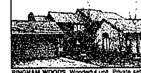
BIRMGHAM WOODS. Wonderful unit. Private setting. Finished basement, 3 fireplaces, all neutral decor, 2 full and 2 half baths. Private decking. Brick paved atrium. $239,900 (ED-W-15TRA) 504362 Call 626-4000.