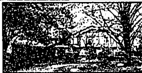
BLOOMFIELD HILLS ACREAGE. Three plus acres of valley terrain with possibility of a lot split. 5 bedroom Tudor home rebuilt in 1980 features large family room with fieldstone fireplace, huge country kitchen. $925,000 (ED-B-678TO) 523344 Call 644-6700