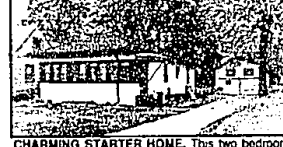
CHARMING STARTER HOME. This two bedroom, one story starter home is ideal. Newer carpeting, fenced yard, garage with upper level storage or workshop. Priced to sell! $74,900 (ED-R-77AUB) 533458 Call 656-6500.