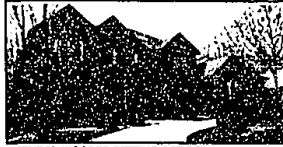
NATURAL WOODED SETTING OFF DECK. In the popular Bloomfield Crossing Subdivision, sits this spacious 4 bedroom, 3 full and 2 half bath colonial. Family room with vaulted ceiling. Finished walk-out lower level with second kitchen. $539,500 (ED-H-33WOO) 500138 Call 648-1400.