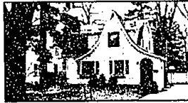
BIRMINGHAM 1920'S CHARMER. Much sought after area in Birmingham. Hardwood floors in most rooms, several new Pella windows, 1994 furnace, 2 fireplaces. 3 bedrooms, 2 baths. $259,900 (ED-B-11VIN) 530566 Call 644-6700.