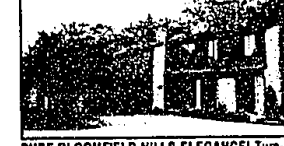
PURE BLOOMFIELD HILLS ELEGANCE! Turn-key spacious condo in back of complex. Fully furnished. 3 or 4 bedrooms, 3 1/2 baths, library, 2-story atrium, finished lower level. 2 car attached garage. $359,000. Also available with furniture. (ED-H-17AFB) 524308 Call 648-1400.