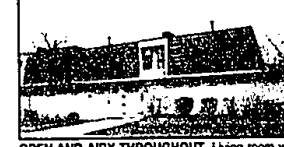
OPEN AND AIRY THROUGHOUT. Living room with glass fireplace and full wall of bookcases. Both bedrooms have private bath. Dining room door to large deck overlooking ravine. Enclosed patio. $157,500 (ED-H-78STR) Call 648-1400.