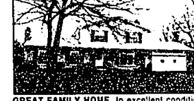
GREAT FAMILY HOME. In excellent condition, hardwood floors, library that could be 5th bedroom. Wonderful floor plan with family kitchen and great room with fieldstone fireplace. Terraced lot with pool. $224,900 (ED-H-31HC) 519146 Call 648-1400.