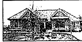
HOMEARAMA'S PEOPLE'S CHOICE AWARD! Stunning ranch with exquisite master suite, double fireplace, sunken Jacuzzi. Full walk-out basement is finished. Quality throughout. $299,900 (ED-W-06HAY) 509198 Call 626-4000.