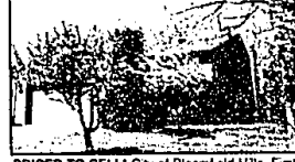
PRICED TO SELL! City of Bloomfield Hills. First floor master suite. Separate dining room, large living room with fireplace. Two additional spacious bedrooms, plus library. All kitchen appliances stay. $259,900 (ED-B-51ARB) 522164 Call 644-6700.