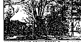
WALNUT LAKE PRIVILEGES! Cozy bungalow. Cherry and brick fireplace add charm to the living room. Dining room with bay window, wrap-around deck with hot tub. 2 car garage. $121,500 (ED-W-06BNK) 448681 Call 626-4000.