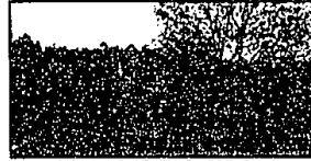
COUNTRY LIVING AT IT'S FINEST. Spectacular Tudor in great location. Lower level finished walk-out leads to decking. 4 bedrooms, 4 baths. To appreciate all this home has to offer, call for a private tour. $479,900 (ED-C-24CED) Call 625-6300.