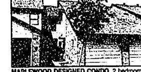
MAPLEWOOD DESIGNED CONDO. 2 bedrooms, 2 baths and neutral. Builder's own unit used as model. White carpeting, move-in condition, built-in galore. Great location in rear of complex. $116,500 (ED-B-89RID) Call 644-6700.