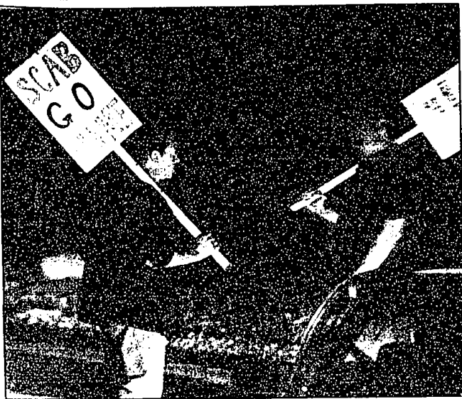
Traffic stoppers: Strikers deliver a message as they walk in front of cars pulling into the newspaper distribution site.

On the march: Strikers temporarily prevent autos from picking up papers Tuesday at the Farmington Hills distribution center.