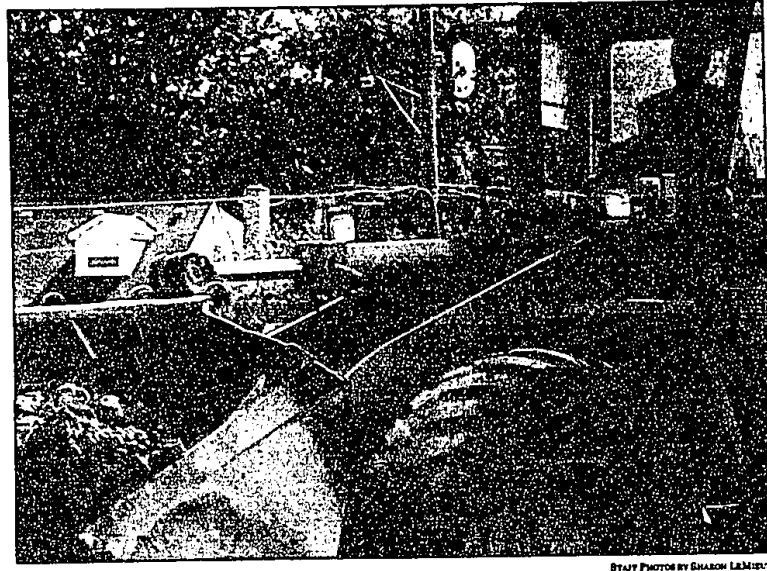
Shovel time: Alex Wiczorek of Statewide Excavating of Wixom is creating storm drains at Farmington High. All three Farmington high schools are undergoing extensive renovations, which include creating additional classroom space.