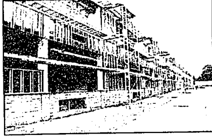
Hip and tuck: North Farmington High is receiving a new facade as well as an expanded cafeteria and media center. The school was built in 1961.