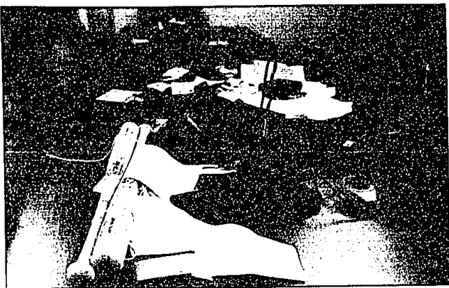
Taken from strikers: Confiscated items taken from strikers — including ball bats, CB radios and nails — are displayed at the Farmington Hills police headquarters.