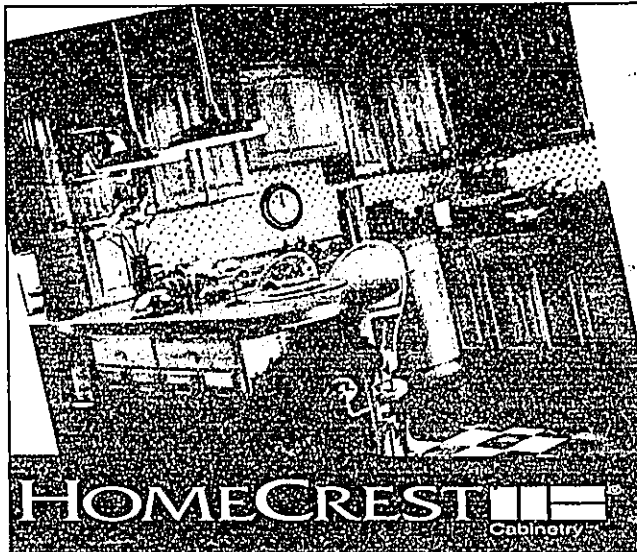
Shown: HomeCrest Bristol Natural

In contrast to the 12-inch high squirrel's tail is the reed grass Phragmites. It too has a head that arches to one side, but it is more feathery and it stands about 8-10 feet tall. Phragmites grows in the low areas along the expressways. In colonial times and in other parts of the continent, people collected the long stems of Phragmites and thatched the roofs of their homes with it. This reed was also used to make ink pens. Inside the hollow stem are fine tubes that transport water up to the top. If you take a dried, dead stalk and cut it off like a quill pen point and dip it into ink, the small tubes will draw up ink and it can be used as a pen. Though squirrel's tail and Phragmites are interesting to see, I saw the most beautiful grass of the season while visiting friends in northern Michigan. Northern Michigan's sandy soils are perfect for the purple love grass to grow. Large patches of purple covered entire fields. Not only did it look beautiful, but it felt wonderful. Each of the delicate branches just barely touched my skin. They feel like fairy fingers deftly tickling you as you walk. Late summer is the time for many grasses to become noticeable. Take the time to see and feel some of these fall grasses.