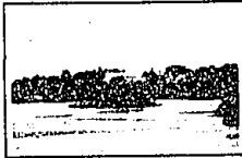
View of beautiful Kirk in the Hills Church from living room of subject property.

This extraordinary 1.9 acre waterfront estate has become available for only the second time in thirty seven years.