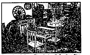
Tynes Past Antiques Bloomington, IL Furniture Pine, early Paint, small Primitives, incl. Pie Safe in old Blue, Hickory Chairs, Store Bin in Pine, turn of century Tricycle.