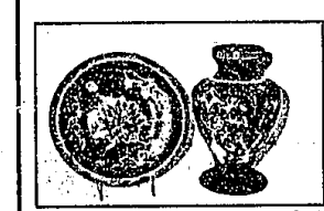
Care Antiques Langhorne PA Fine Pottery incl. Dutch Gouda, Milton, English Melica, Oulmer, Moorcroft etc. Dutch Gouda c1920 "Flower" Vase.