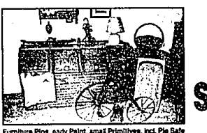
Furniture Pine, early Paint, small Primitives, incl. Pie Safe in old Blue, Hickory Chairs, Store Bin in Pine, turn of century Tricycle.