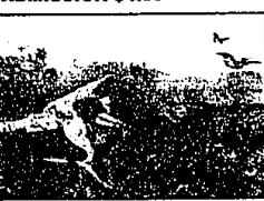
James Kahilo Shelbyville MI Currier & Ives "American Field Sports" large folk with period birdsy maple frame.