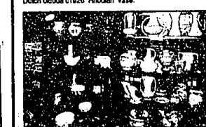
Woodworth & Hogen Ann Arbor, MI 20th Century American Art Pottery incl. Walker, Red Wing, Rumf, Roseville, mid 20th C decorative Accessories incl. Aluminum.