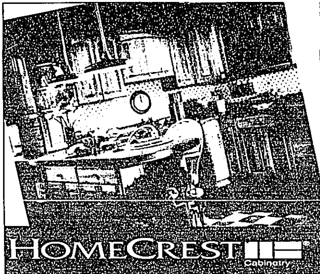
Shown: HomeCrest Bristol Natural