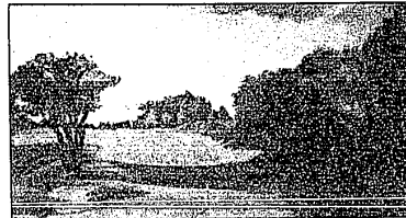
Green dreaming: If Phil Karbo can't be on the course at least he can dream of the challenges waiting for him.