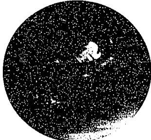
World's Biggest Man-made Sld Flying Tower Ironwood, MI