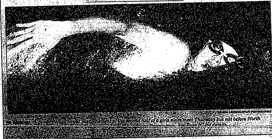
Swimmers receive an incomplete at the end of a girls swim meet Thursday but not before North.