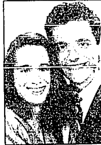
Georgetown University Law Center. He is employed by Booz-Allen and Hamilton, Inc. in McLean, Va. as a corporate counsel. A December wedding is planned.

Her fiancé is a magna cum laude graduate of the University of Connecticut with a bachelor's degree in accounting. He also graduated cum laude from