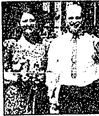
University, in England. They are making their home in University Village at MSU.