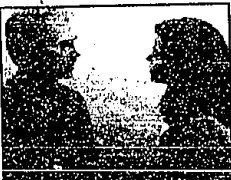
David Caruso and Linda Fiorentino star in the psychological thriller "Jade" opening Friday at metro Detroit movie theaters.