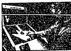
Embark on an exciting exploration of the human brain at "It's All In Your Head: An Exhibit About the Brain," opening at Cranbrook Institute of Science.