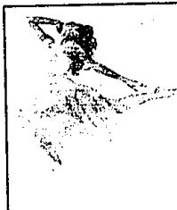
Hot tix: Dance Nounce presents three concerts at the Millennium Theatre Center in Southfield, Oct. 13-15. Call (810) 552-7000 for ticket information.