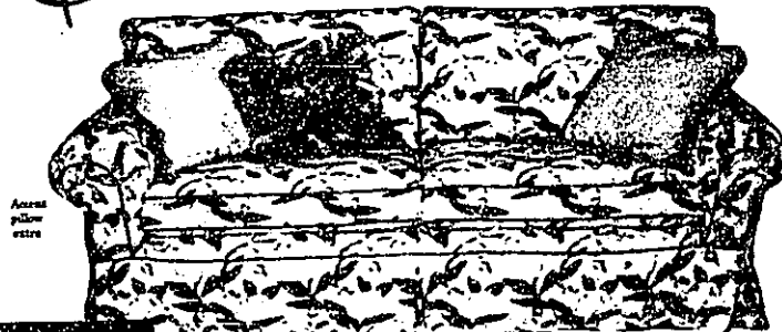
Accent pillow extra