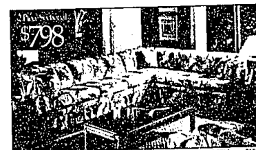
2 Piece Queen Sleeper Sectional $798 was $1599