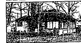
CONDO ALTERNATIVE. Charming 2 bedroom starter ranch. Neutral decor. Updated kitchen. Ceiling fan in master bedroom. Basement. Fenced yard. Deck. Lake privileges. $64,900 (ED-W-43VIS) 520660 Call 626-4000