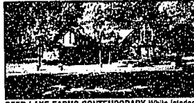
DEER LAKE FARIUS CONTEMPORARY. White interior, open floor plan, newly remodeled kitchen w/sub-zero, double wall ovens & frosted ash cabinetry. Breathtaking master bedroom suite w/walking room. Lake privileges on all-ports Deer Lake. $499,000 (ED-26DEE) Call 625-4300