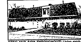
OPEN AND AIRY THROUGHOUT! Living room with glass fireplace enclosure & full wall of book cases & shelves. Two bedrooms, 2 1/2 baths. Dining room has doorwall to large deck. $157,500 (ED-H-78STR) 512245 Call 646-1400