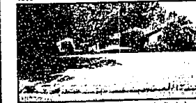
A PASTORAL SETTING. Spacious ranch situated on 1.5 acres with a brook flowing through the property. 4 bedrooms, 2 1/2 baths, spacious family room with fireplace. Central air, alarm system. All appliances included. $257,000 (ED-B-83SPR) 536479 Call 644-6700