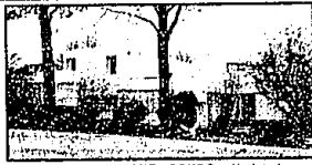
WABEEK LAKEFRONT CONDO. Updated and contemporary. Beautiful white kitchen, magnificent ceramic tile foyer, vaulted ceilings with skylights. Abundant recessed lighting, gorgeous master bath. This is a great buy. $459,900 (ED-W-54ALE) 507320 Call 626-4000