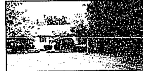
UPDATED CALIFORNIA CONTEMPORARY RANCH. Northern Michigan feeling on a large, private lot. Wonderful floor plan. 4 bedrooms, 2 1/2 baths, large family room, 2 fireplaces, 2-tiered decks. Finished walk-out lower level. $282,000 (ED-B-20COL) 548551 Call 644-6700