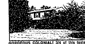
GORGEOUS COLONIAL! 3/4 of this fastidiously decorated home was rebuilt in 1989. There is a wonderful great room, 2 1/2 baths, a spa on a private dock, huge master bedroom. $223,500 (ED-H-04HAR) 544220 Call 646-1400