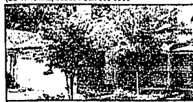
ABSOLUTELY SPECTACULAR 2 bedroom, 3 1/2 bath, townhouse style luxury condo with a dramatic 3 story chandelier, finished walk-out with a 10 person hot tub and wet bar, private balcony in a wooded setting. $199,000 (ED-R-31TIM) 543904 Call 656-6500