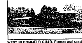
WEST BLOOMFIELD QUAD. Elegant and spacious, 3369 sq. ft. custom built on an estate sized lot in beautiful Powder Horn. Four bedrooms have adjoining baths. Hardwood floors in foyer and kitchen. $279,700 (ED-H-13HAR) 440079 Call 646-1400