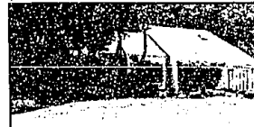
WEST BLOOMFIELD CONTEMPORARY! Extensive decking, gazebo and hot tub on a magnificent ravine lot. 3 bedrooms, 2 1/2 baths, great room and library. White ceramic kitchen with top of the line appliances. $369,900 (ED-W-79OAK) Call 626-4000