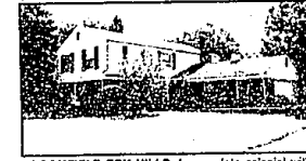
BLOOMFIELD FOX HILLS. Immaculate colonial with 4 bedrooms, 2 1/2 baths, family room with fireplace & doorwall leading to patio. Offers central air, many exposed hardwood floors & first floor laundry. $189,900 (ED-H-40WEY) 537589 Call 646-1400