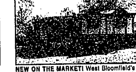
NEW ON THE MARKET! West Bloomfield's most affordable subdivision. Tudor Style Tri-Level. Updated kitchen, gorgeous large corner lot, 2 1/2 car garage, newer roof. Family room with fireplace. $134,900 (ED-W-65AER) 553767 Call 626-4000