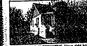
SUPER CONDO ALTERNATIVE. Move right into this updated ranch. Two bedrooms, white Eurostyle kitchen, skylights, recessed lighting, tiled baths and glassed-in porch. 2 car garage. $112,500 (ED-B-28LIN) 505957 Call 644-6700