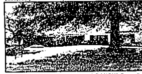
PRIZE DOWNTOWN FRANKLIN RANCH! Sprawling home with 3 bedrooms, 2 1/2 baths. Loaded with air, alarm, new kitchen, new fixtures, hardwood floors, circular drive, double lot. Charming and elegant! $375,000 (ED-B-15EVE) 539058 Call 644-6700