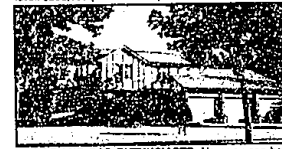
HOUSE AND CAR ENTHUSIASTS. Now you can have it all. Wonderful Troy Tudor with 4 large bedrooms, 2 1/2 baths, library, family room, finished basement, plus room for 4 cars in garage. Great Value-Great Buy! $234,800 (ED-B-53ELM) 547774 Call 644-6700