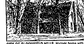
CITY OF BLOOMFIELD HILLS. Historic home with up-north views, featuring privacy, nature, & tranquility. Small size - great for single or couple seeking charming older home in an area of larger homes. $349,000 (ED-H-20HIL) 550841 Call 646-1400