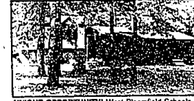
UNIQUE OPPORTUNITY! West Bloomfield Schools, on all sports Middle Strata Lake. Excellently maintained. 3 spacious bedrooms, living room, family room with fireplace and an oversized 2 1/2 car garage. $124,900 (ED-W-60ASH) 548393 Call 626-4000