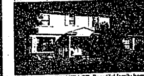
ENJOY THIS PRIVATE LOT. Beautiful family home on cul-de-sac features 4 bedrooms, family room, formal living and dining room, first floor laundry. Shed has electricity. Birmingham Schools. $237,000 (ED-B-88HIV) 554923 Call 644-6700