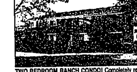
TWO BEDROOM RANCH CONDO! Completely redone and unit. Kitchen with new appliances, cabinetry, and flooring. New windows, furnace with A/C, close laundry, dock with handicap ramp. Freshly carpeted and painted. $113,000 (ED-H-02LON) 507574 Call 646-1400