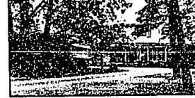
WING LAKE PRIVILEGES. Unbelievable upgrades in this 4 bedroom, 2 1/2 bath colonial. Shared private beach with dock and boat storage. New kitchen, carpet, window treatments, hardwoods, and appliances. Finished lower level. $375,000 (ED-H-61LAK) 537667 Call 646-1400