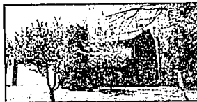
BLOOMFIELD HILLS CONDO. Wonderfully located. First floor master suite with tub and shower. Dining room, formal living room with fireplace. Kitchen with eating space, all appliances. Priced below state equalized value. $239,900 (ED-B-51ARB) 547953 Call 644-6700