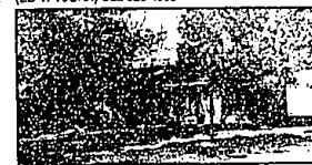
ALL SPORTS PINE LAKEFRONT! Completely redone in 1990. Gourmet white kitchen with granite counter tops. Master suite with jacuzzi and steam shower overlooking pond in back. $479,900 (ED-W-08PIN) 547449 Call 626-4000