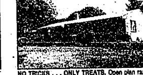
NO TRICKS... ONLY TREATS. Open plan ranch in Westchester Village. Family room with fireplace opens onto a deck to expand leisure activities to the out of doors. 3 bedrooms. Full basement. Birmingham schools. $200,000 (ED-B-20MID) 547149 Call 644-6700