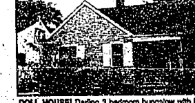
DOLL HOUSE! Darling 3 bedroom bungalow with large master upstairs. Full fenced yard. Great kitchen with eating area. Ready to move into. $99,900 (ED-W-18OAK) 551255 Call 626-4000