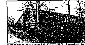
WOODED UP-NORTH SETTING. Located in the Cloisters on the Lakes. Spacious courtyard entry with patio and gas grill. Newly painted, and close to pool, clubhouse, tennis and lake privileges. $179,000 (ED-H-78BOR) 503685 Call 646-1400