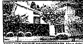
OPEN AND BRIGHT CONTEMPORARY. Move right in on Upper Strata Lake. Enjoy the sun on your wrap-around deck. Perfect home for entertaining and waterfront living. Land Contract available to qualified buyer. $499,000 (ED-H-49COL) 530569 Call 646-1400