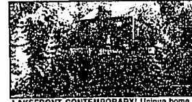
LAKEFRONT CONTEMPORARY! Unique home on Watkins Lake with 3 bedrooms, 4 full baths, lodgepole suspension bridge to entrance, 3 story circular stairway. Incredible master suite & finished walkout. $349,900 (ED-H-21WAT) 543894 Call 646-1400