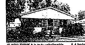
IF YOU THINK it is truly unbelievable... A 4 bedroom ranch with a garage and an amazing price tag. We are still shaking our heads! The owner said "SELL!" Obviously he is serious. $69,900 (ED-W-08INN) 551877 Call 626-4000