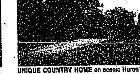
UNIQUE COUNTRY HOME on scenic Huron River. Access to all sports Fox Lake. Sun and beach privileges on Carrol Lake. Updated cape cod with 3 bedrooms, 1 1/2 baths, newer sunroom, fireplace and family room. $109,000 (ED-W-38ASH) 543107 Call 626-4000