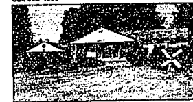
QUALITY BUILT RANCH! Over an acre, park-like lot. 3 bedrooms, 2 fireplaces, finished basement has family room, bedroom and bath. Hardwood floors. Newer furnace and central air. $114,900 (ED-W-09SCO) 545937 Call 626-4000