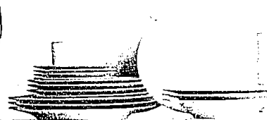
"Maison" dinnerware. 20-piece set. Reg. $127.80. Sale $79.95.