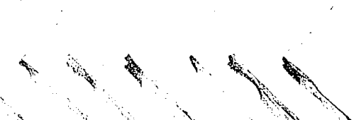
White cotton dinner napkins. Set of 8. Reg. $18.95. Sale $11.95.