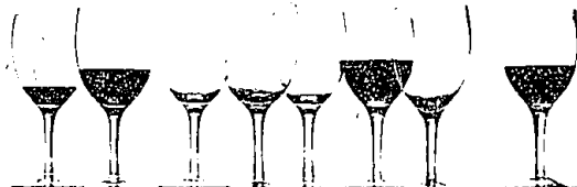
"Montreal" goblets. Set of 8. Reg. $20. Sale $13.95.