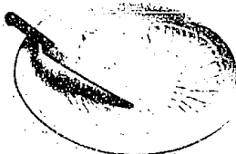
Turkey platter. Reg. $41.95. Sale $34.95. Turkey slicer. Reg. $39.95. Sale $31.95.