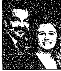
Police Academy. He is employed by the Houston Police Department.

Her fiancé is a graduate of Troy Athens High School, Oakland Community College, Michigan State University and the Houston