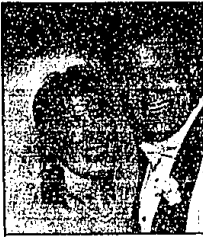
Country Club after which the couple left for a trip to Orlando, Fla., and on a Carnival Cruise.

Following the wedding there was a reception at the Greystone