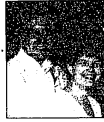
A reception was held after the wedding at the pavilion. The couple honeymooned on a cruise to the Bahamas. They are living in Piedmont.