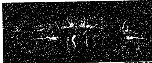
Holiday ballet: Michigan Classic Ballet Company members rehearse for their upcoming production of the "Nutcracker."