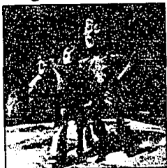
The rivalry between two toys leads to comic complications in Walt Disney Pictures' new animated comedy-adventure "Toy Story."