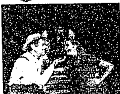
The Village Players of Birmingham present "My Favorite Year." Call (810) 644-2075 for ticket information.