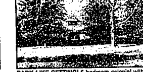
PARK LIKE SETTING! 5 bedroom colonial with lake privileges on 1.5 acre setting. Great entertainment flow. In-law quarters. Birmingham Schools. $459,900 (ED-W-94MEA) 554808 Call 626-4000