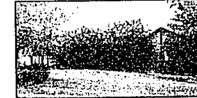
DISTINGUISH YOURSELF! Prestigious 5 possibly 6 bedroom ranch with walk-out lower level and over 5,000 sq. ft. of living space. Come see why this residence is different. $599,000 (ED-W-97MEA) 540942 Call 626-4000