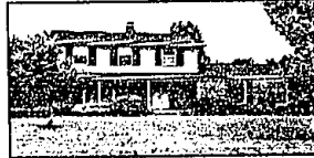
PERFECT TRANSFEREE HOME! Numerous updates! Neutral decor, exposed hardwood floors, large professionally finished recreation room. Bloomfield Hills Schools. $225,900 (ED-W-56BLA) 532435 Call 626-4000