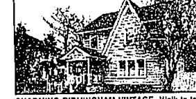
CHARMING BIRMINGHAM VINTAGE. Walk-to-town from this updated 20's home with 3 bedrooms, 1.5 baths, new kitchen, first floor laundry. Special touches: hardwood, neutral berber, French doors, brick patio. 2 car garage. $224,500 (ED-B-51LIN) Call 644-6700