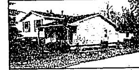
ALL SPORTS LAKE! Privileges. 3 bedrooms, family room with fireplace, central air, newer windows, 2.5 car garage with opener. Security lights, concrete drive with nicely manicured yard. $125,000 (ED-W-32DAR) Call 626-4000