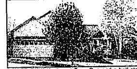
SUPER BUY! Northwest Troy. One and a half story with large first floor master with whirlpool tub. All bedrooms have walk-in closets. Wood foyer, full basement. Clean as a whistle! $234,600 (ED-B-09APP) Call 644-6700