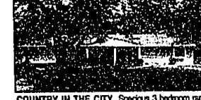
COUNTRY IN THE CITY. Spacious 3 bedroom ranch. Much updating. Neutral decor. Fireplace. Skylights. Attached screened porch with cathedral ceiling. Large treed lot. Nicely landscaped. $129,000 (ED-W-68BRI) 542372 Call 626-4000