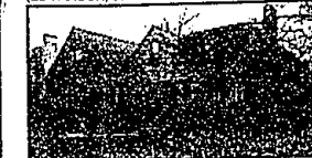
BRICK AND STONE TUDOR. Lovely family neighborhood with Bloomfield Hills schools. Four bedrooms, 1 1/2 baths, library, screened porch off living room. Gracious, clean quality. Hurry! $157,500 (ED-H-36BAR) 557234 Call 646-1400