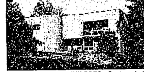
WALNUT LAKE PRIVILEGES. Custom built contemporary with 4-5 bedrooms and 4 full baths. Lower level walkout with 46x26 entertaining area, bath & bedroom. Wooded private lot. $750,000 (ED-H-06LON) 559903 Call 646-1400