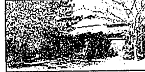
3 STAR WINNER! Best value in Clusters on the Lake. 3 large bedrooms and 3 full baths. Great room and family room, 2 car garage. Bloomfield Schools, pool, tennis, clubhouse and Lake views. $177,900 (ED-W-48BOR) 556632 Call 626-4000