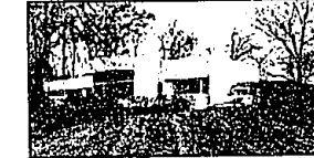
ENJOY SERENITY AND ELEGANCE in this 7 acre lakefront setting in Bloomfield. An open floor plan, generous living space and expansive windows with world class views. Endless features, a true sanctuary. $3,900,000 (ED-H-65CLU) 557340 Call 646-1400