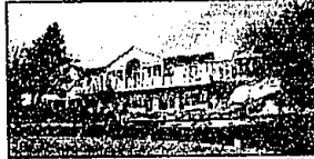
SOPHISTICATED ELEGANCE. City of Bloomfield. Quality renovation in 1990. Inviting garden room overlooks expansive rear lawn with pool and specimen plantings. Walk-out lower level exercise room. Extensive use of wood. $345,000 (ED-H-71BEN) 512857 Call 646-1400