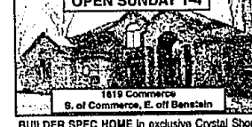
BUILDER SPEC HOME in exclusive Crystal Shores Subdivision. 4 bedroom, 3.5 baths plus walk-out. Lakefront and canal front building sites available. $409,900 (ED-W-18WAS) 550350 Call 626-4000