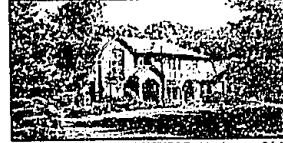
CUSTOM CHESTNUT RUN TUDOR. 4 bedrooms, 3 full, 2 half baths. Beautiful private setting, well done pool, dock, sunroom, large rec. room in lower level walkout. Security, Intercom, gourmet kitchen. $840,000 (ED-H-59CHE) 528532 Call 646-1400