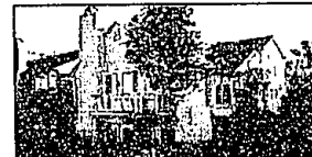
GRACIOUS LIVING AT THE "HEATHERS" overlooking the golf course and the lake! Open floor plan, all-white kitchen w/oak floor, large master suite, fireplace in great room. Absolutely gorgeous! $344,900 (ED-C-01NEV) Call 625-9300