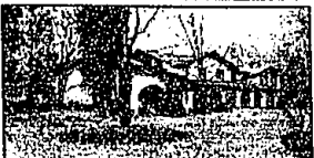
BLOOMFIELD HILLS PRIVACY on 2.2 wooded acres behind Bloomfield Hills Country Club. Mission style home custom built in 1979. Soaring ceilings. New master suite in 1991 with his and her baths. $1,740,000 (ED-B-40VAL) 422482 Call 644-6700