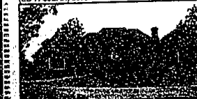
USZTAN CONSTRUCTION created this masterpiece on 4.078 acres with maple, cherry and oak hardwood flooring. Downview European gourmet kitchen with four-way limestone fireplace. Many more features. $1,150,000 (ED-R-00COL) 432171 Call 656-8500