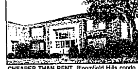
CHEAPER THAN RENT. Bloomfield Hills condo, 2 bedrooms, 2 baths, overlooking commons area and near clubhouse and pool. New windows and newer appliances. Carpet. Good value! $67,800 (ED-B-85FOX) Call 644-6700