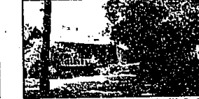
LAKEFRONT MERCER CONTEMPORARY. On 2 plus acres of privacy. First floor master with lake view. Den, 3 fireplaces, finished walkout includes family & exercise rooms, wet bar, 2 full baths & loft. $1,075,000 (ED-H-60THR) 640008 Call 646-1400