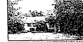
UPDATED CALIFORNIA CONTEMPORARY RANCH. Northern Michigan feeling on a large, private lot. Wonderful floor plan. 4 bedrooms, 2.5 baths, large family room, 2 fireplaces, 2-tiered docks. Finished walk-out lower level. $282,000 (ED-B-20COL) 548551 Call 644-6700