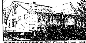
BIRMINGHAM BUNGALOW. Close to town, parks and shopping. This home is larger than many in the area, with a large living room and dining room. $115,000 (ED-B-26CHA) Call 644-6700