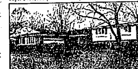
MAGNIFICENT VIEWS. The Rouge River winds around heavily wooded yard. Newer since 1990 are 2 furnaces, roof, gutters, vinyl siding, garage door, deck, porch, ceramic kitchen floor & carpets. $335,000 (ED-H-48ROH) 557227 Call 646-1400