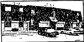
CLINTON TOWNSHIP CONDO. Seller motivated to move. Secured entrance. 2 bedroom, 1 bath, walk-in closet in master bedroom. Stove and refrigerator included. Living room with balcony. Window air conditioner. $33,900 (ED-R-41HIL) 551125 Call 656-8500.