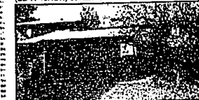
CLOISTER ON THE LAKES. Living room overlooking state patio and lovely courtyard. Three bedrooms, large master with walk-in closet. Pella windows, den, finished basement. Also for rent at $2000/mo. $189,500 (ED-H-54BOR) 557037 Call 646-1400