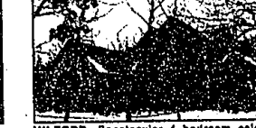
MILFORD. Spectacular 4 bedroom colonial. Delightful kitchen, family room, fireplace. Master suite, library, and dining room. 3 car garage. A real show place! $354,900 (ED-W-98TIM) 557338 Call 626-4000