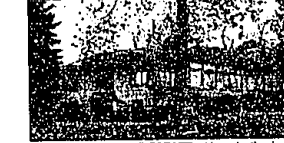
ISLAND LAKEFRONT ESTATE with majestic views of Kirk in the Hills. Private peaceful setting reminiscent of a European countryside. Reconstructed in 1982 to be elegant, yet unpretentious. By appointment only. $1,695,000 (ED-H-27KIR) 556925 Call 646-1400