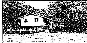
BLOOMFIELD SCHOOLS. Quality Quad-level on fabulous treed lot. 4 bedrooms, 3 baths, family room and den. Lovely patio plus spacious screened porch. $309,000 (ED-B-58HUN) 515121 Call 644-6700