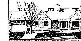
CLARKSTON RANCH CONDO. Beautifully appointed with great room, vaulted ceilings, fireplace, 2 bedrooms, 2.5 baths, and walk-out. Smaller complex pets allowed. $159,900 (ED-W-79NEW) 557505 Call 626-4000