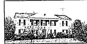
JUST YOUR SIZE. Measured to fit growing families. 4 bedroom, 2.5 bath, floor to ceiling fieldstone fireplace. Large master suite, deck. West Bloomfield Schools. $189,900 (ED-W-61KIN) 556531 Call 626-4000