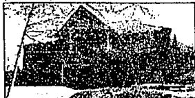
BREATHTAKING LAKEFRONT. Up north feeling in like-new site condo in Hills of Lone Pine. 24 hour gated community. Views of Hidden Lake. Custom kitchen built-ins. 3 bedrooms, screened porch. $945,000 (ED-B-42NOR) 513181 Call 644-6700