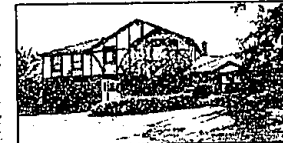
QUALITY GRASSI TUDOR on a large high lot. Lower level walkout rec. room. Updated kitchen adjoining spectacular family room which opens to multi-tiered deck. Finishing touches include hardwoods, crown moldings and bays. $499,000 (ED-H-14BRO) 553873 Call 646-1400