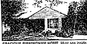
SPACIOUS BIRMINGHAM HOME. Must see inside, you won't believe the space! Extra large gourmet kitchen with eating space. 4 bedrooms, 2 baths. Family room with built-in cabinets. Many upgrades. $149,900 (ED-B-49PEN) Call 644-6700