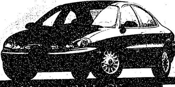
1996 Mercury Sable GS