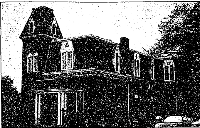
At the Masonic Temple: A luncheon and card party will start at noon Thursday, Jan. 4, at the Masonic Temple (above), Farmington Road and Grand River, Farmington. The event is sponsored by Trinity White Shrine.