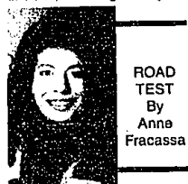
ROAD TEST By Anne Fracassa

ers, door-mounted power door locks and window controls and some new interior fabrics.