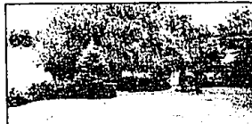
CUSTOM FRANKLIN RANCH With 4 bedrooms, 3 baths near Country Club. Loaded with custom features, fabulous gardens, quality location, over 3000 square feet with hardwood floors throughout. $435,000 (ED-B-00LAK) Call 644-6700