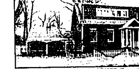
IN-TOWN BIRMINGHAM CHARMER Exceptional curb appeal. 4 bedrooms, 1.5 baths, family room, and beautiful yard with mature trees. $249,000 (ED-B-59HAR) Call 644-6700