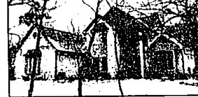
MILFORD Spectacular 4 bedroom colonial. Delightful kitchen, family room, fireplace. Master suite, library, and dining room. 3 car garage. House is immaculate, a real show place. $354,900 (ED-W-98TIM) 557338 Call 626-4000