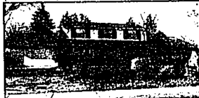
QUARTON LAKE AREA. First floor master suite, 2 & 1/2 baths, two bedrooms on second floor, family room. Screened & glassed porch, pool, terrace, lot & a half. $549,900 (ED-H-35G1E) 552060 Call 646-1400