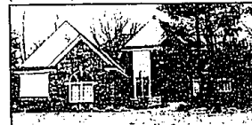
FABULOUS - ALMOST NEW! Access to all-sports Commerce Lake. Great Room, hardwoods, library with French doors. Kitchen has Sub-Zero refrigerator. Back stairway to second level walk-out. $396,000 (ED-H-18WAN) 557825 Call 644-1400