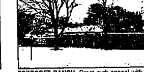
FOXGROVE RANCH. Great curb appeal with this 3 bedroom, 2 bath charmer. Very large family room and 3 fireplaces plus a beautiful lot. $269,000 (ED-B-35POM) Call 644-6700