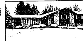
WEST BLOOMFIELD QUAD. Custom built 3,369 sq. ft. home in beautiful Powder! Horn. Four bedrooms - adjoining baths. Hardwood in foyer and kitchen. Newly decorated, newer carpet. $279,700 (ED-H-13HAR) 538119 Call 645-1400