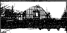
PICTURESQUE PRIVACY Play basketball in the indoor court of Isiah's former home. 1.65 acres in the City of Bloomfield Hills. 5 fireplaces, state of the art security system and more. $995,000 (ED-B-74CHA) 527414 Call 644-6700