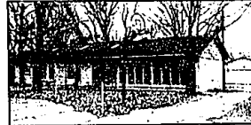
ALL SPORTS PINE LAKEFRONT! Completely redone in 1990. Gourmet white kitchen with granite counter tops. Master suite with jacuzzi and steam shower overlooking pond in back. $479,900 (ED-W-06PIN) 547449 Call 626-4000