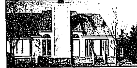
ENJOY THE HEATHERS. Charming living room with vaulted ceiling. Spacious master, cheery kitchen with island, separate dining room with doorwall. Neutral throughout, two bedrooms and two baths. $269,000 (ED-H-90UPP) Call 646-1400