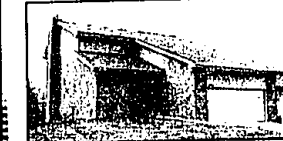
ONLY ONE REMAINING! Quality new construction condo! View of golf course, highlighted by appointments - fireplace, walk-out basement, loft, office, all appliances and so much more. $178,900 (ED-W-46FAI) 516193 Call 626-4000