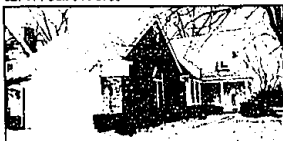
DOWNTOWN BIRMINGHAM Newer home with first floor master suite, white kitchen with large eating area, 2 fireplaces, first floor laundry, 2 car attached garage. Great location. $465,000 (ED-B-685OU) Call 644-6700