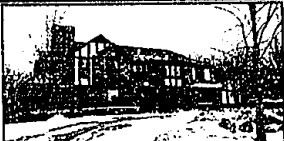
CUSTOM CHESTNUT RUN TUDOR. Four bedrooms, three full, 2 half baths. Pool, deck, sunroom, and walkout. Security, intercom, wet bar & gourmet kitchen. Luxurious master suite. $840,000 (ED-H-59CHE) 528032 Call 646-1400