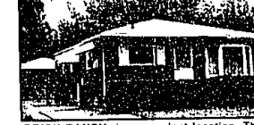
BRICK RANCH in convenient location. Three bedrooms & one and one-half baths. New windows, two car detached garage. Appliances included. $75,000 (ED-H-35BEE) 541494 Call 646-1400