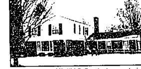
BLOOMFIELD FOX HILLS. Four bedroom colonial, 2 & 1/2 baths, family room with fireplace. Central air, many hardwoods, first floor laundry. Tennis, pool, pre-school and clubhouse. Immediate occupancy. $184,900 (ED-H-40WEY) 537589 Call 646-1400