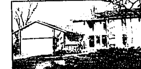
BETTER THAN NEW! This Brick/Cedar contemporary boasts 3 bedrooms, 2.5 baths. Appliances are included in the almond formica kitchen. Deck overlooks wooded lot. 1st floor Master suites, and laundry room, neutral decor. $219,900 (ED-W-70NCR) 54475 Call 626-4000