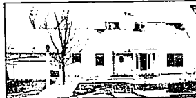
CLARKSTON RANCH CONDO Beautifully appointed with great room, vaulted ceilings, fireplace, 2 bedrooms, 2.5 baths, and walk-out. Smaller complex pets allowed. $159,900 (ED-W-79NEW) 557505 Call 626-4000