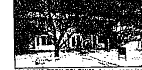
SPACIOUS TROY COLONIAL. Large rooms include 4-5 bedrooms, library, 3 full baths, huge family room, screened porch, inground pool and treed yard. $309,000 (ED-B-50HOM) Call 644-6700