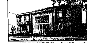
CHEAPER THAN RENT Bloomfield Hills condo with 2 bedrooms, 2 baths, overlooking commons area and near clubhouse with pool. New windows and newer appliances. $67,800 (ED-B-85FOX) Call 644-6700