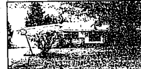
WONDERFUL LAKEFRONT OPPORTUNITY. This 2 bedroom, 2 bath ranch is located on approximately 1 & 1/2 acres. 2 car attached garage, deck with Jacuzzi and outdoor lights. $325,000 (ED-H-35LON) 600022 Call 646-1400