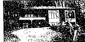
ALL THE AMENITIES PLUS DEER LK FRONTAGE. Updated, immaculate, private brick ranch w/walkout on all sports Deer Lk. Amenities include dock, secluded deck w/hot tub, built-in entertainment center w/51" TV, 3 fireplaces, whirlpool tub, deluxe Kohler fixtures in Masterbath. $625,000 69 DEC 625-9300