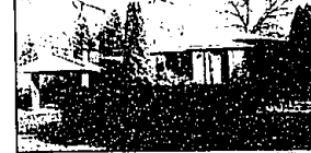
THIS CHARMING RANCH on a 300 foot park-like lot is perfectly updated throughout. 2 fireplaces, one in master. 1.5 baths, full basement. This must be seen to appreciate. $69,900 (ED-W-40NAN) 541332 Call 626-4000