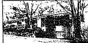
SPACIOUS RANCH. Beautiful lot extending to Vornor Lake with huge deck overlooking woods and lake. Family room opens to kitchen sharing two-way fireplace with den. $449,900 (ED-H-51COM) 551993 Call 646-1400