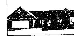
NEWER WEST TROY RANCH Offers master suite plus 2 additional large bedrooms, 2.5 baths. Great room with brick fireplace, library, full basement, central air and more. $239,900 (ED-B-01JOR) Call 644-6700