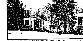
CITY OF BLOOMFIELD HILLS. Upper unit, 2-3 bedrooms, 2 baths. Third bedroom could be den or library. Wet bar, neutral, enclosed porch off living room & master bedroom. $150,000 (ED-H-40WOO) 600270 Call 646-1400