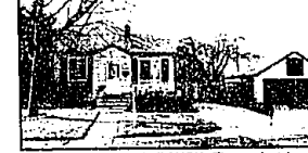
TOTALLY UPDATED RANCH. The perfect house. The perfect price. Full basement, double lot, 2.5 car garage. Clean and ready to move into and priced to sell. $79,900 (ED-W-85ABE) 541152 Call 626-4000