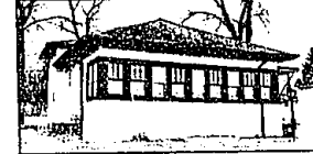
CHARMING STARTER HOME. This 2 bedroom, one story starter home is ideal. Newer carpeting, fenced yard, garage with upper level storage or workshop. Priced to sell! $72,500 (ED-R-77AUB) 533458 Call 656-6500