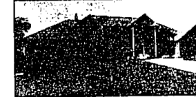
OAKLAND TOWNSHIP ENTERTAINING DELIGHT! Two story indoor pool, hot tub, finished walk-out basement, five bedrooms, 3 1/2 baths, plus all the amenities expected of an executive home $525,000 (ED-R-40VAL) 552994 Call 656-6500