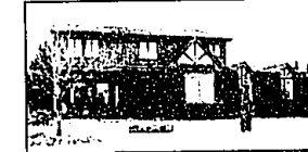
TROY COLONIAL. 4 bedrooms, 2.5 bath Tudor style home with library, first floor laundry, marble flooring in foyer and kitchen. Finished rec room, family room with fireplace. $248,900 (ED-B-18CHA) Call 644-6700