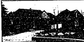
A WORK OF ART! Composed with care and skill, this masterful 4 bedroom, 5,790 sq. ft. dream home, with its outstanding landscaping and 3 car garage with its outstanding landscaping and 3 car garage is waiting for you. Perfection is the word for this home. $525,000 (ED-W-614CZ) 550949 Call 626-4000