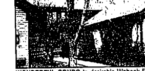
WONDERFUL CONDO in desirable Wabek Pines. Spacious travertine foyer, remodeled white kitchen with hardwood floor, bright and sunny with courtyard entrance. First time offered. $315,000 (ED-B-45PIN) Call 644-6700