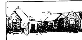
IMMEDIATE OCCUPANCY! Builder's Model - Commerce Pines. Professionally decorated, landscaped, security system, central air, volume ceilings, and skylites. 400 plus sq. ft. luxury master suite! $224,900 (ED-W-10VOK) 558802 Call 626-4000