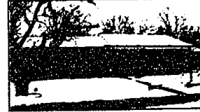
BLOOMFIELD HILLS SCHOOLS. Very well maintained pillared colonial. Privately sited amidst tall trees. Newer ceramic foyer, 4 bedrooms, updated powder room. 1st floor laundry, finished basement. $319,900 (644-6300) 607803 CD-2295