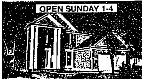
NEARLY NEW waiting for you! Spacious living area in this newer 3 bedroom, 2 1/2 bath, dining room plus finished basement. Open design in the foyer and follows you thru out. 560 Recreation, N. of Commerce, E. of Hiller. $247,500 (851-5500) 605274 CD-525