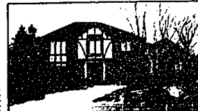
VERY CUSTOM CASADEI BUILT TUDOR on huge Bloomfield Crossing lot. 4 bedrooms, Euro style kitchen, expanded family room with cathedral ceiling and high brick fireplace, library. (644-6300) 548966 CD-2295