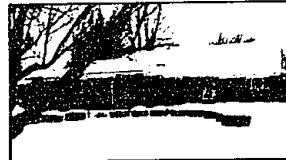
CHARMING, BRIGHT AND INVITING 2 BEDROOM TUDOR. Living room with sculptured doorways, window seat, fireplace. Family room with 3 walls of windows. 18152 Sunnybrook, N. of 11 Mile, W. of Southfield. $119,000 (644-6300) 6085 CD-2310