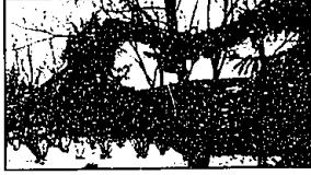
CITY OF BLOOMFIELD HILLS LUCKENBACH designed condo. Very spacious rooms with high ceilings. 3 bedrooms, 3 1/2 baths, family room, library, fireplace, finished walk-out lower level. (644-6300) 536198 CD-7031