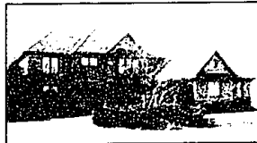
SLEEK AND SOPHISTICATED 4 bedroom colonial on a treed lot. Amenities include tiered decking, brick paver patio and 3 car garage. Walk-out lower level with a kitchenette, hot tub, full bath. $329,900 (651-3500) 607087 CD-2231