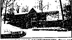
BLOOMFIELD HILLS CONTEMPORARY. Open and bright with many windows on 1st floor. Impressive dining room, 4 bedrooms, 3 baths, 3 fireplaces. Finished lower level walk-out. 3-car attached garage. (644-6300) 534153 CD-51039