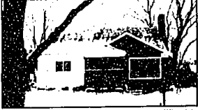
A RARE FIVE BEDROOM HOME LOADED with amenities. Crown moldings, 6 panel doors. Family room with built-ins. Wonderful master suite with walk-in closet. Kitchen with eating area. 2 1/2 car garage. $275,000 (644-6400) 607844 CD-2295