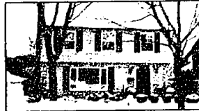
THREE BEDROOM BRICK RANCH with lots of potential. 9x14 breezeway. Living room with natural fireplace, hardwood floors. Shop area not finished. Porch, outside light, fenced yard. Newer electrical $99,500 (644-6300) 607986 CD-2302