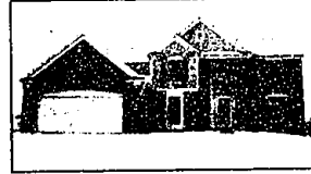
RECENTLY REDECORATED AND UPDATES BEVERLY HILLS RANCH. 3 bedrooms, 2 baths. Gourmet kitchen with JennAir Island, top appliances. Family room with paneled Andersen window wall. $215,000 (644-6300) 608515 CD-2295