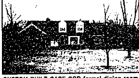
CUSTOM BUILT CAPE COD formal dining room, bay window in living room, kitchen with an abundance of cabinets. Master suite with 2 closets. Master bath, 2 skylights, acre lot, many custom features. $329,900 (851-5500) 605246 CD-2296