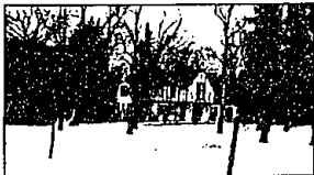
LANDMARK CITY OF BLOOMFIELD HILLS estate situated on 2.53 acres. 6 bedroom, 5 1/2 bath Tudor with interior displaying old world craftsmanship. Pool and grounds keeper cottage included. (644-6300) 529038 CD-525