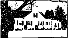
LATHRUP CAPE-COD 3-4 bedrooms, 2 1/2 baths, newer windows and doors, newer roof, furnace, air condition. Large corner lot. 2 1/2 car garage. Family room, living room has fireplace. Large foyer. Many updates. $184,900 (851-5500) 607336 CD-525