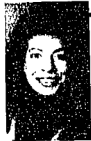
ROAD TEST By Anne Fracassa

All of that adds up to a lot more comfort, a lot more hauling capacity and the ability to get in and out of the vehicle easily.