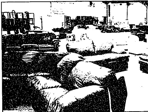
Gorman's outlet store is at 2400 Telegraph Road (just south of 10 Mile Road) in Southfield.