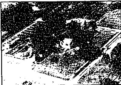
The Steinkopf Nursery, 1957.

Steinkopf family members have two goals for their business - to expand their operations to accommodate their growing customer base and to continue honoring their founding grandparents. "We're closed on Sunday at the request of my grandfather and grandmother. They felt it was a day to be with the family." But the nursery is