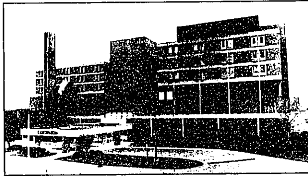
Crittenton Hospital offers Free Physician Referral Services, Weight Management Center, Fitness Institute, Women's Center, Occupational Medicine Program and Intensive and Cardiac Care Units and extensive outpatient diagnostic and treatment programs.

In addition to its 400-plus medical staff, composed of MDs and DOs, it has a dedicated board of trustees and a