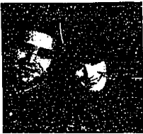
State University. He is a resident in orthopedic surgery at Philadelphia College of Osteopathic Medicine. A June wedding is planned.