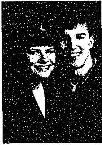
agreement. He is employed by Central Distributors, Inc. A July wedding is planned at Michigan State University Alumni Memorial Chapel.