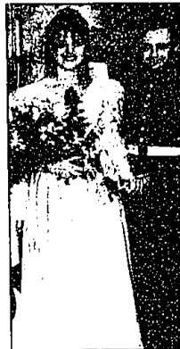
A reception was held in the park at the couple's apartment complex following the ceremony. They reside in Vista, Calif.